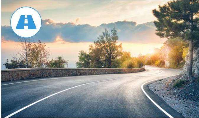
Safety Road Map

1 - 5 Employees 6 - 19 Employees 20 - 49 Employees