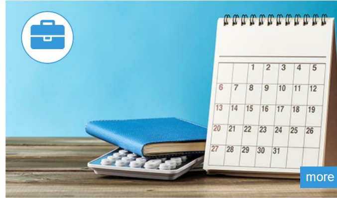
Business Case for Safety

1 - 5 Employees 6 - 19 Employees 20 - 49 Employees